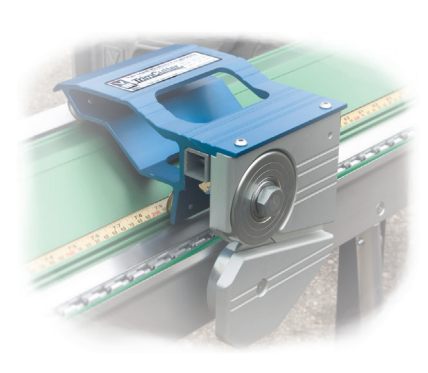
TrimCutter<sup>™</sup> speeds up your work process saving both time & money! (sold separately)