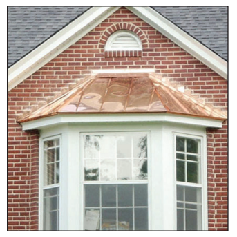
Copper Bay Windows