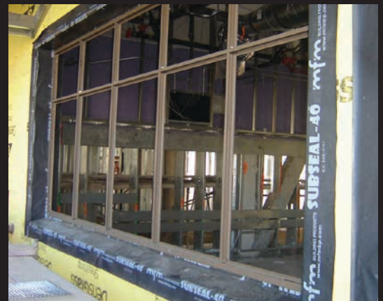
SubSeal bonds aggressively to poured concrete and other building materials. It is fully adhered to the substrate to eliminate movement of water under the membrane.