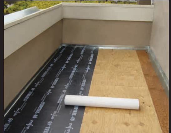
SubSeal is an excellent choice for waterproofing balcony decks and other surfaces that will be finished with concrete or tile.

Call one of our professionals today at 800-882-7663 to get your project on the right track.