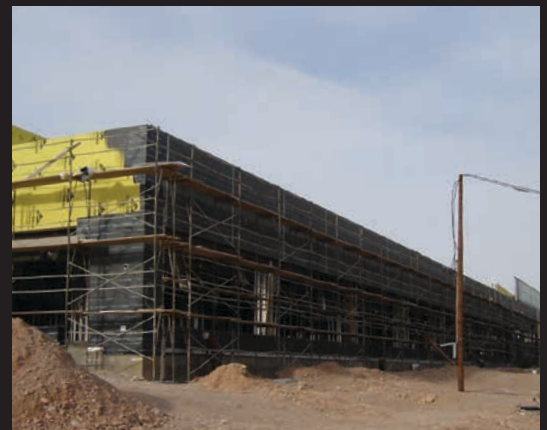
SubSeal offers high strength, high elongation and is flexible to accommodate expansion and contraction of the substrates.