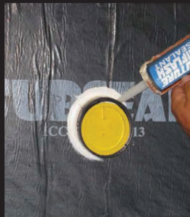
Applying sealant at all pipe terminations is an excellent way to complete a proper waterproofing job.