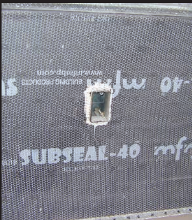
Apply polyurethane sealant when terminating all exterior penetrations.