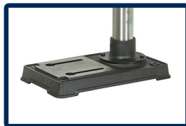
Sturdy Cast Iron Base