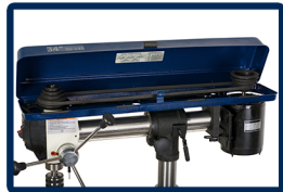
Five Available Spindle Speeds