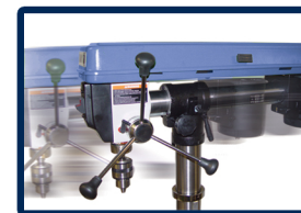
Head Moves Forward and Back