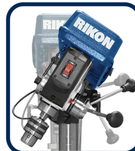
Head Tilts 45° Right and 90° Left