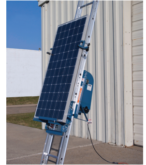
Solar Panel Carrier w/ Classic Electric Drive

Platform Hoists are easy to transport and assemble and require minimum maintenance. A variety of available accessories makes RGC Platform Hoists the most versatile on the market.