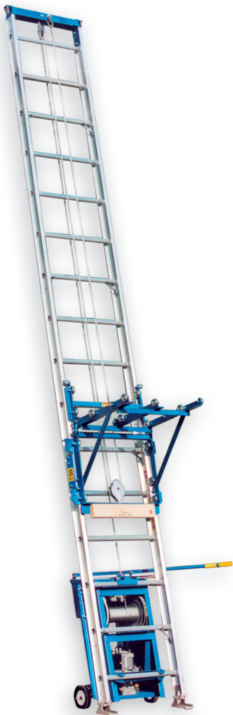
400 lb. Platform Hoist with PRO G Power Drive